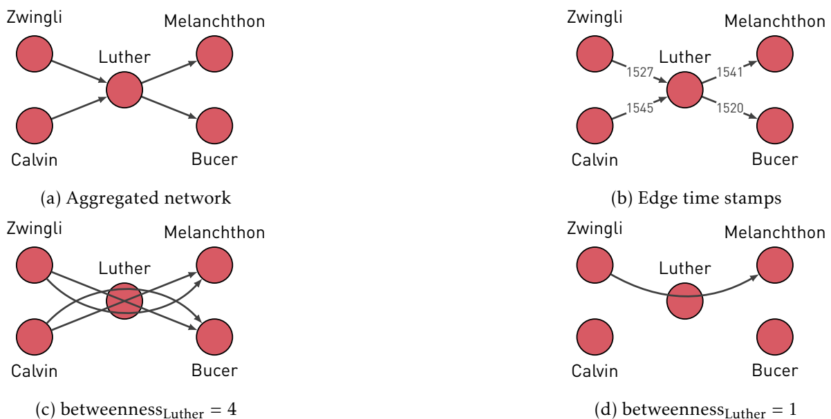
Figure 1: Betweenness scores differ when computed on the aggregated network (a, c) and when accounting for time-stamped edges (b, d). In the aggregated network, time is ignored which allows information to spread backwards in time (e.g., Zwingli passes information to Luther in 1527 which Luther passes on to Bucer in 1520).

This contribution discusses the challenges of accounting for temporal information in the transmission of ideas in historical communication networks. Traditional approaches have mainly analyzed temporal snapshots of aggregated networks to account for changes in the network (Lemerrier 2015; Petz, Ghawi and Pfeffer 2020; Düring et al. 2011). In this approach, the observation period is divided into subperiods (snapshots), interactions within one subperiod form a network snapshot, and topological differences between consecutive network snapshots are analyzed.